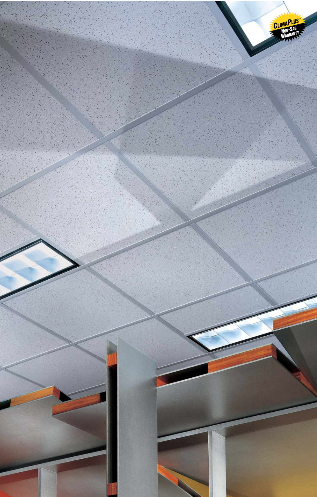
Medium textured panel